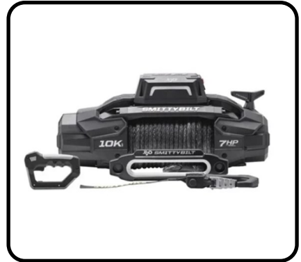
Recovery Gear and Winches

Ford® and Bronco® are registered trademarks of Ford Motor Company®