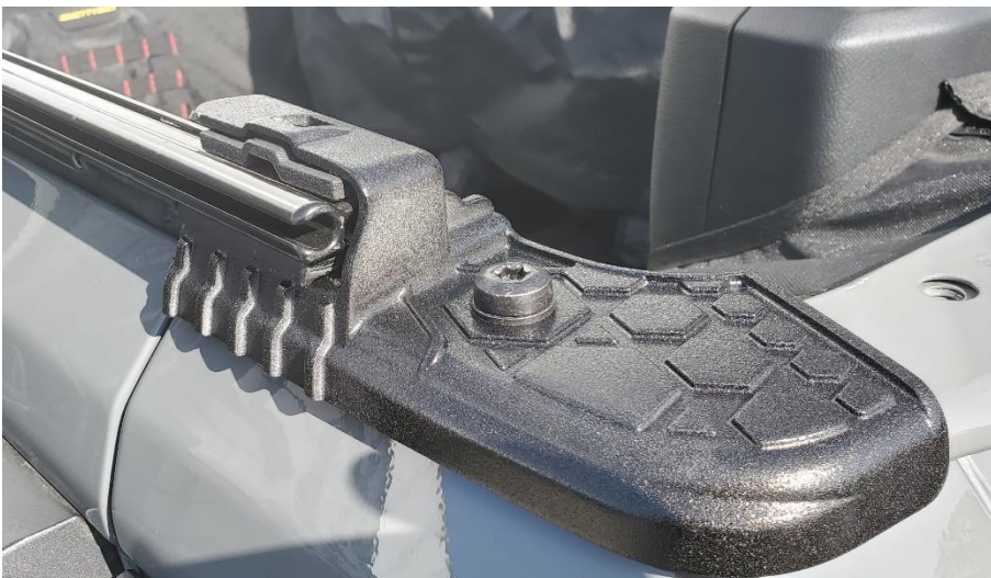
Photo shown with bare tailgate bar for greater detail of mounting.