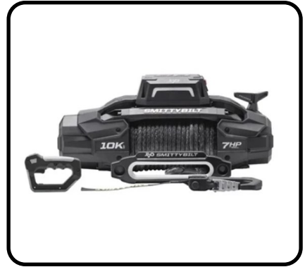
Recovery Gear and Winches

Ford® and Bronco® are registered trademarks of Ford Motor Company®