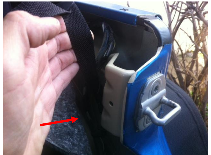
(Fig T, 4-Door)

Step 9: Once all of the straps are loosely installed, position side piece into desired location and then proceed to fully tighten all straps. (Fig U, V) Repeat on other side.