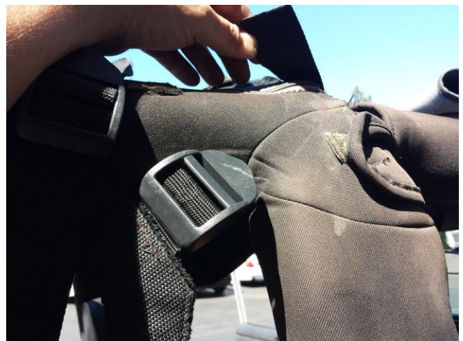
( Fig R)

For Technical Support/Warranty Information please call 310-762-9944