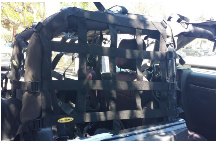
( Fig Q, 2 Door)

Step 7: Loosely place one side section on vehicle. Fig P, Q (Note the logo goes towards the rear of the vehicle).