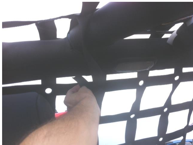
(Fig F, 4 Doors)

For Technical Support/Warranty Information please call 310-762-9944