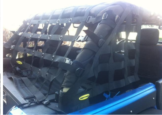
(Fig W, X)