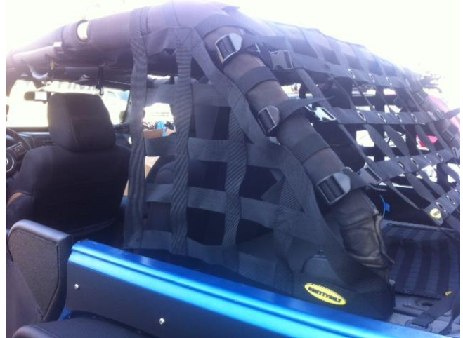
(Fig P, 4- Door)

Step 7: Loosely place one side section on vehicle. Fig P, Q (Note the logo goes towards the rear of the vehicle).