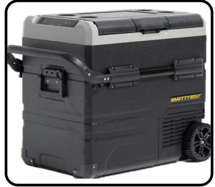
Waypoint™ & Basecamp™ Fridge

Ford® and Bronco® are registered trademarks of Ford Motor Company.