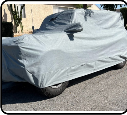
Bronco® Full Cover

Thank you for choosing Smittybilt accessories for your Ford Bronco® needs! If you would like to view our full range of available vehicle and overlanding accessories, please visit us at www.smittybilt.com