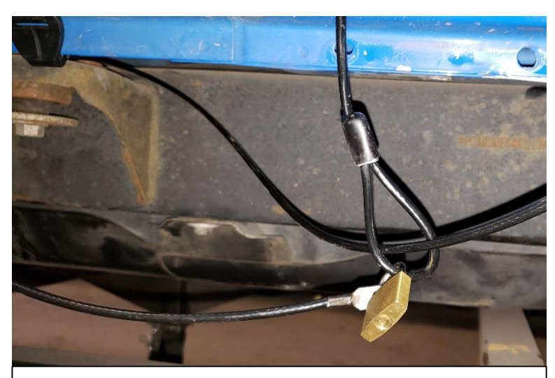
Short cable only hooks to one side of vehicle around body mount. Lock junction placed away from painted body to avoid damage.