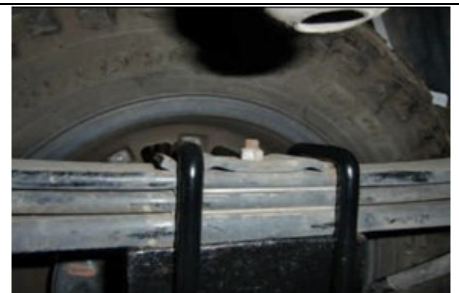
Make sure the top of the U-bolt is aligned in channels on upper plate.