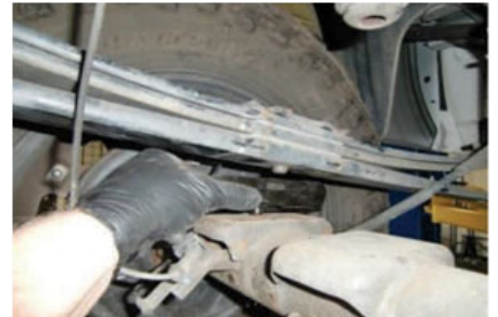
4WD Models; Remove factory block.