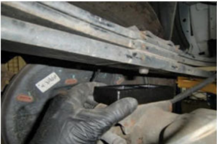
1" Blocks: Place new 1" block and take care that the pin is aligned with the hole in the block.