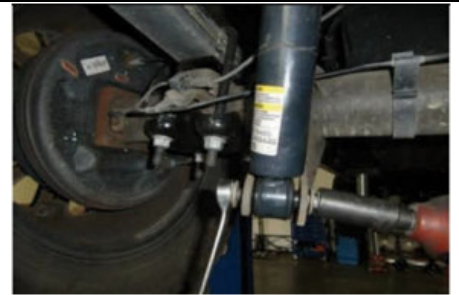
Remove lower shock bolt.