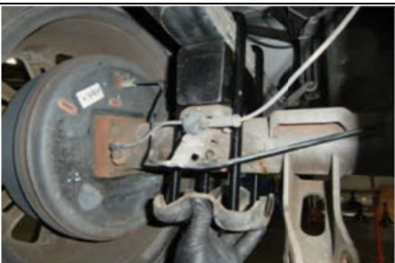
Reinstall lower plate.