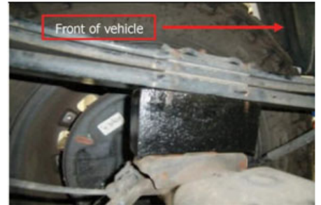
Tapered block with shorter end towards front of vehicle.