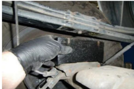
Tapered Blocks: Place block and take care that the pin is aligned with the hole in the block.