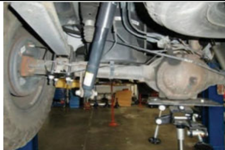
Support the rear axle with a jack.