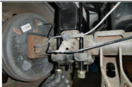
Install new, longer, U-bolts and hardware.