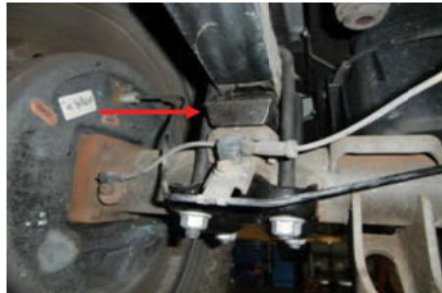
4WD models will have a factory block.