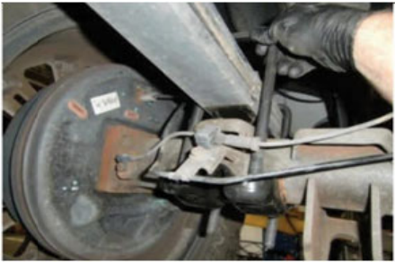
Remove U-bolt mounting hardware.