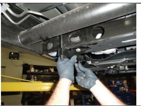
With torsion bar tool remove adjuster bolt.