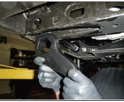
Install new forged torsion keys into position and slide torsion bar into hex as original.