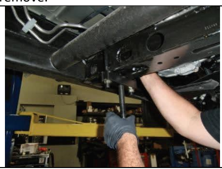
Use torsion bar loading tool and adjust new forged torsion key up just enough to allow adjuster block to be reinstalled.