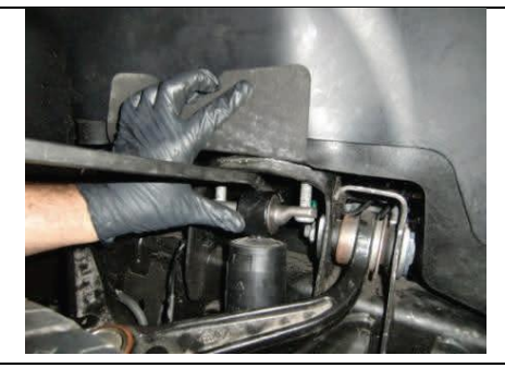
Back to the front shocks; pry down enough to allow provided spacers to be installed onto upper shock mounting studs.