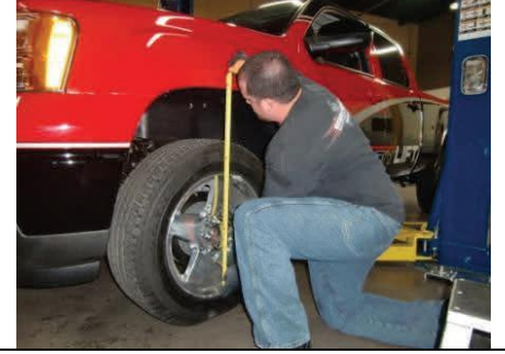
Measure ride height then lift vehicle and remove wheels/tires.