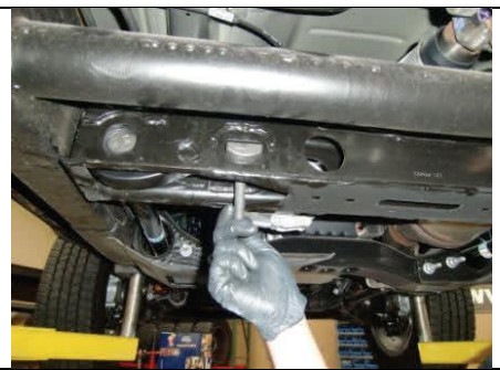
Now, install torsion key adjuster bolt and adjust for initial setting. Final adjustments will be done during alignment.