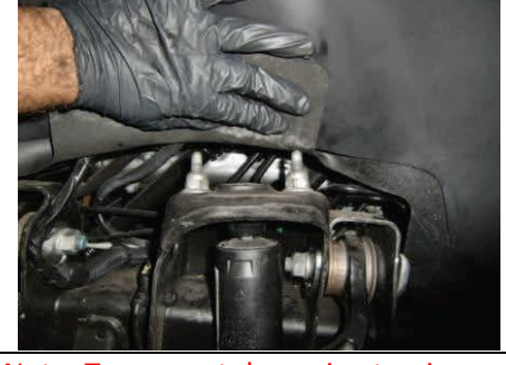
Note: To prevent damaging torsion bar tool. Peel back wheel well liner and remove (2) upper shock mounting nuts.