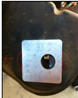
1.5 degree more (positive) caster