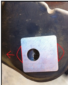
1.5 degree less (negative) caster